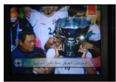
Iraq Flogs Australia, Wins Asia Cup