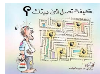
Which Way Home?