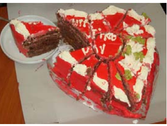
Valentine Cake for The Singles