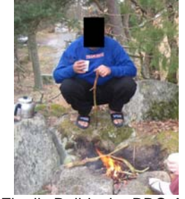
X Finally Builds the BBQ After Getting Asylum in Sweden