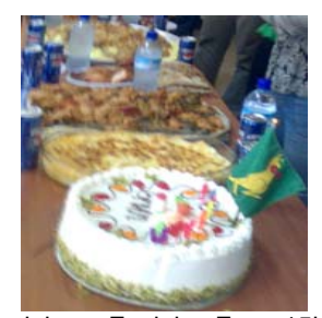
Um, dolma .. Explains Extra 15kgs !