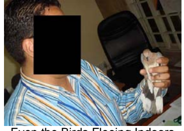
Even the Birds Fleeing Indoors