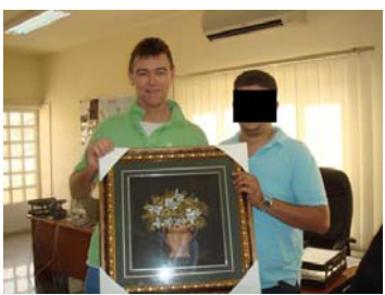
..So X Flees North to Erbil