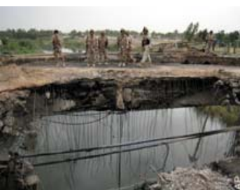
Not That Way - Diyala Bridge