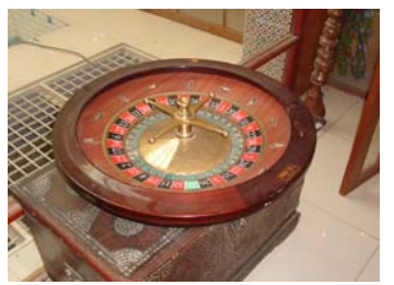
It's a Gamble